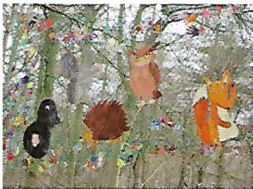
"Woodland Creatures". Created by children and staff from Cam Woodfield Infant School.

Schools and Colleges have used the opportunity to encourage the development of students' artistic and creative talents.